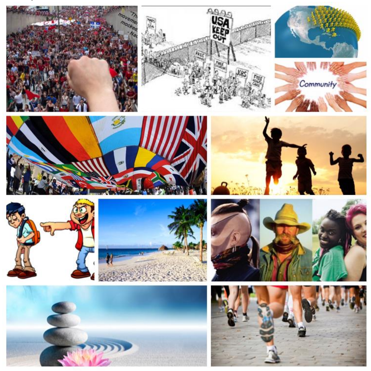
DCP1 March 7, 2016