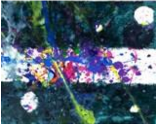
2 nd piece inspired by Kusama