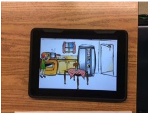
used ipad as resource