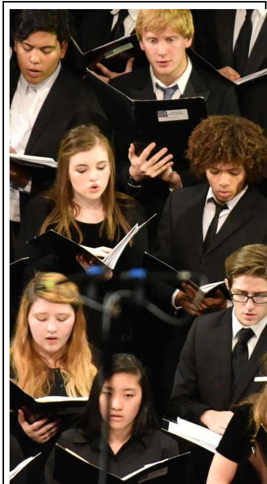
Photo credit: “National Association for Music Education All National Honor Ensemble” by Howard Rockwin

National Coalition for CORE ARTS Standards